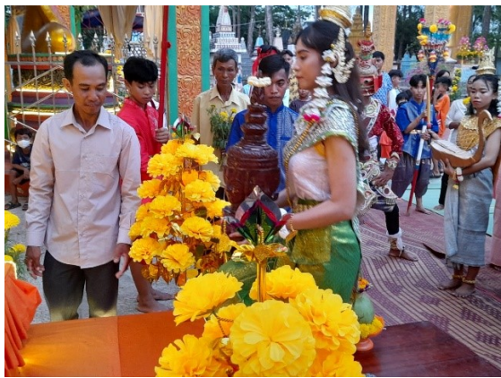
Fig. 3: Positioning the Four-faced Deity in the procession of the Great Calendar at Sro Lon Pagoda, My Xuyen District, Soc Trang Province

ritual, the temple prepares the head of the Four-faced Deity, which is the central symbol of the procession. The deity is made of materials such as wood or stone, and its head has four faces, each facing a different direction. The central symbol of the procession is the Four-faced Deity, typically made of materials such as wood or stone. The statue has four faces, each facing a different direction. The statue is placed on a silver or gold tray. The Great Calendar procession takes place within the main courtyard of the Khmer