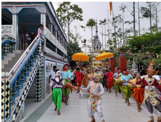
Fig. 2: The ritual of welcoming Tevada Chnam Thmay around the main hall in 2023 at Sro Lon Pagoda, My Xuyen District, Soc Trang Province