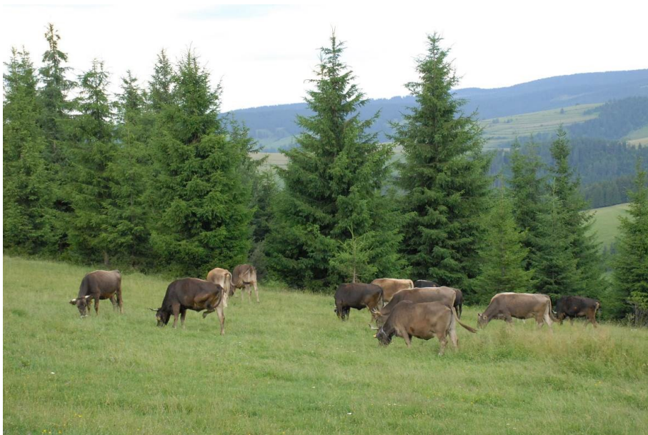
Fig. 3: “Géngyűrű” nucleus stock of alpine cattle ecotype “Mokany”. Csiksomlyo, Eastern Carpathians. Owner: HaGK; breeder: Dobos Attila