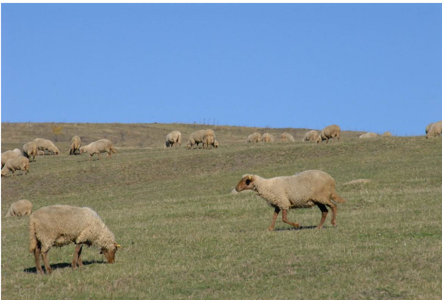
Fig. 6: Alpine sheep ecotype “Covasna Yellow-face Berke”. Gyimes Region, Eastern Carpathians. Owner and breeder: Rákossy Zsigmond, part-owner: HaGK