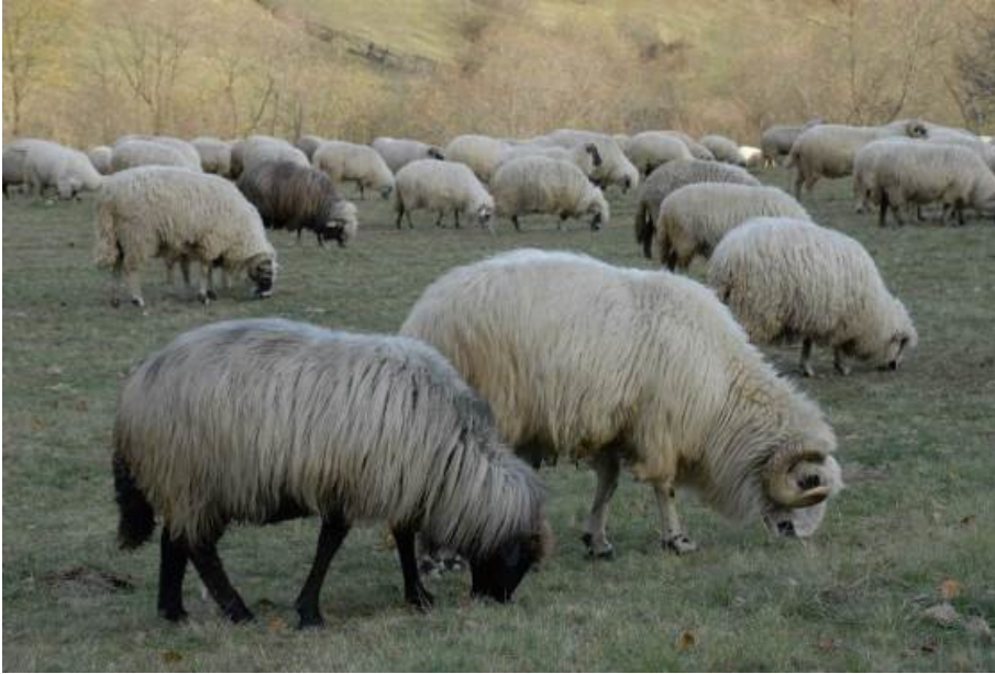
Fig. 7: Alpine sheep ecotype “Erdelyi szalas juh”. Csikmadaras Region, Eastern Carpathians. Owner and breeder: Gall Levente