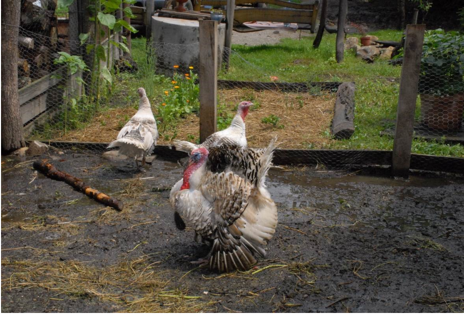
Fig. 9: Transylvanian turkey ecotype “Tarka erdelyi pulyka”, Homorodalmás. Owner: MGE, breeder: Kobolkuti Lorand (Photo: Szalay I. 2016)

One of the main principles of gene rescue of any local breed or ecotype must be the organisation of nucleus stocks in their original habitat or very similar to it. Moreover, parallel with the collection of animals, ethnographic and rural studies of the sources, related to the livelihood, habits and traditions of local people, as well as keeping, production and the use of local breeds should be of main importance.