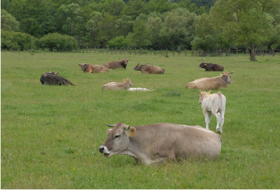
Fig. 4: “Karpati borzderes” cattle nucleus stock at Mikohaza, North-East of Hungary. Owner and breeder: Miklos Rudolf

Transylvanian Gyimes Racka or “Erdelyi szalas juh” (Figure 7). This sheep is a characteristic long and strait fur breed of Csik and Gyimes subregions with no specific breeding programme to maintain. The existing conservation programme in Hungary under the breed name Gyimes Racka can be qualified as ex situ conservation of a local variety. Further local livestock needs to be rescued in Szeklerland (Szekelyfold) is a local long and strait fur goat (“Erdelyi szalas kecske”, Figure 8) bred in different colour varieties. Nucleus gene bank stocks of the mentioned small ruminant breeds are conserved at HaGK in vivo , ex situ gene bank too.