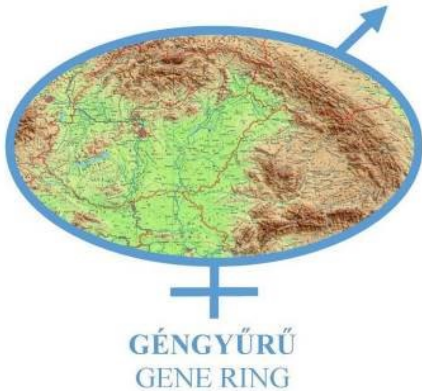
Fig. 2: Logo of the “Gengyuru”-“Gene Ring” Programme