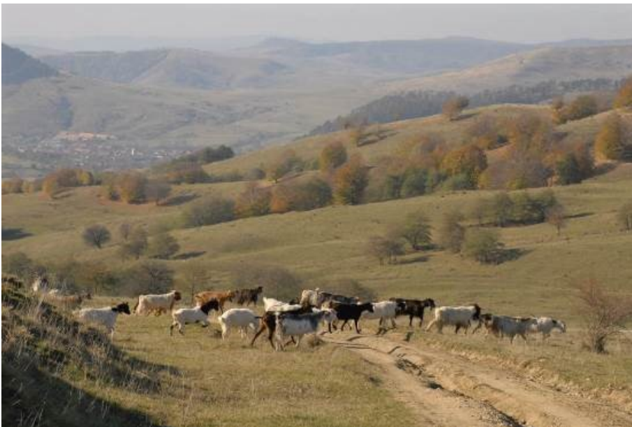
Fig. 8: Alpine goat ecotype “Erdelyi szalas kecske”. Homorodalmás. Owner and breeder: Koblakuti Lorand, part-owner: HaGK