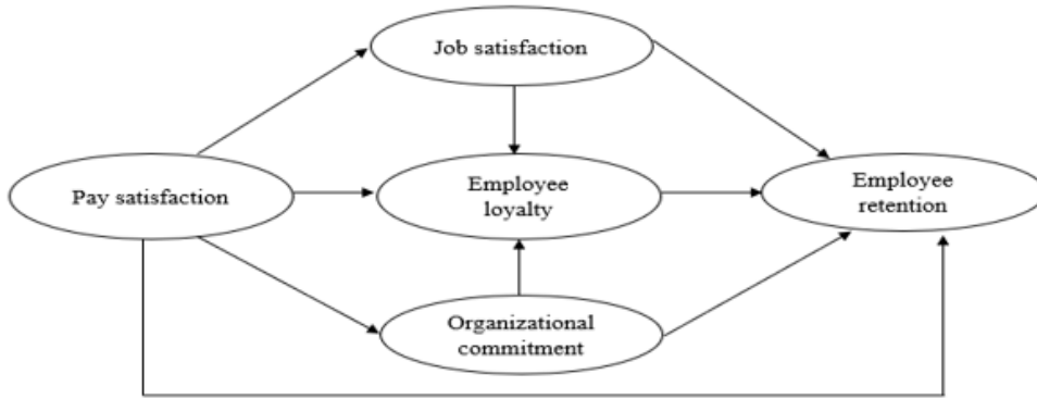
Fig. 1: Study framework